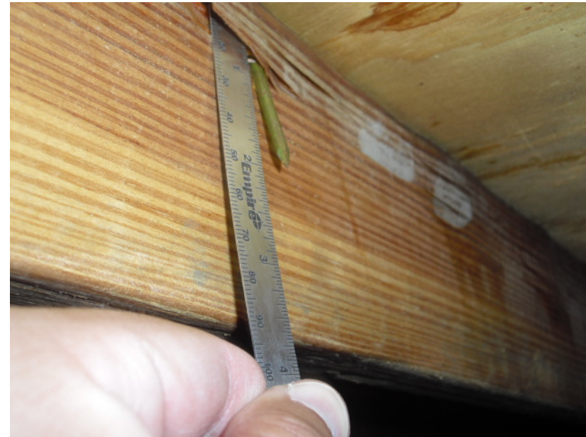
Overview of Nail Size