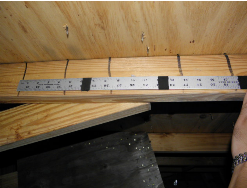
Overview of Nail Spacing