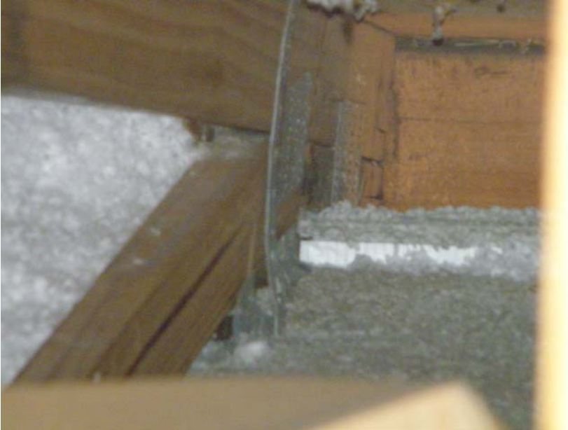
Overview of Roof to Wall Attachment