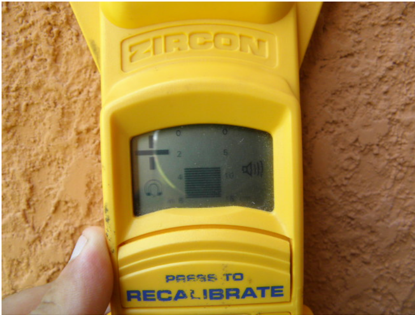
Overview of Wall Construction