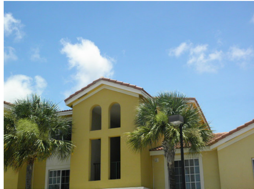
Overview of Roof Geometry