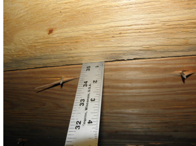
Overview of Decking Thickness